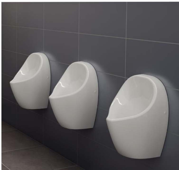
Image of a typical installation in a contemporary washroom